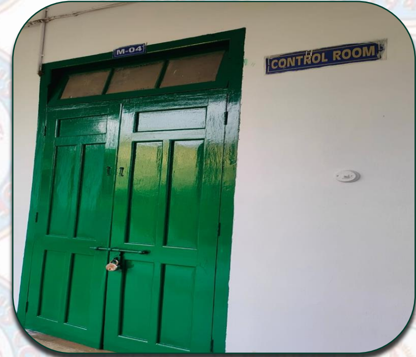
Examination Control Room

Promotes physical fitness and wellness for students.