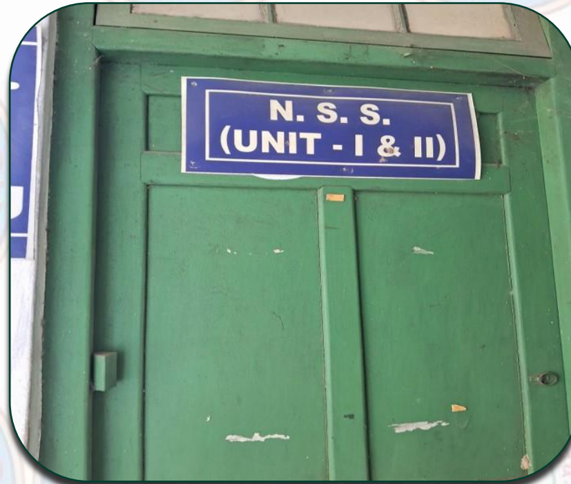
NSS Unit Rooms

Ensures inclusive access and equal opportunities for all.