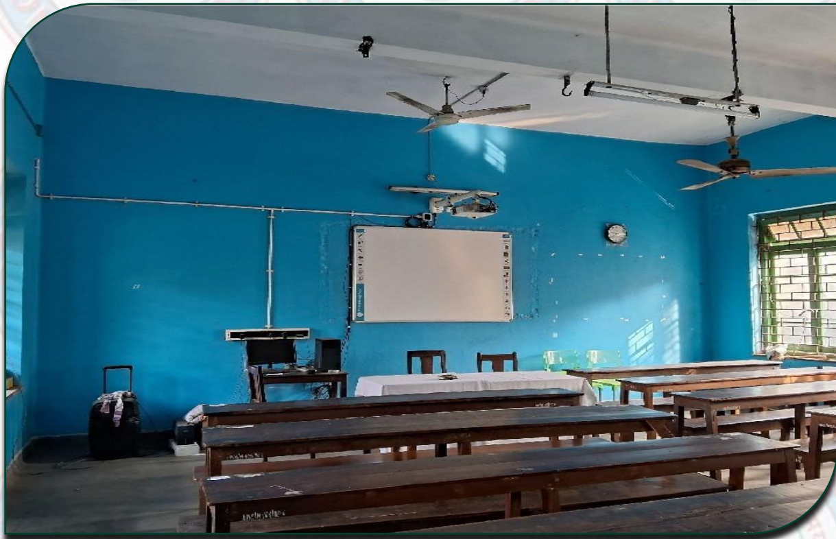
Smart Classroom (1)

Integrated technology for interactive lessons.