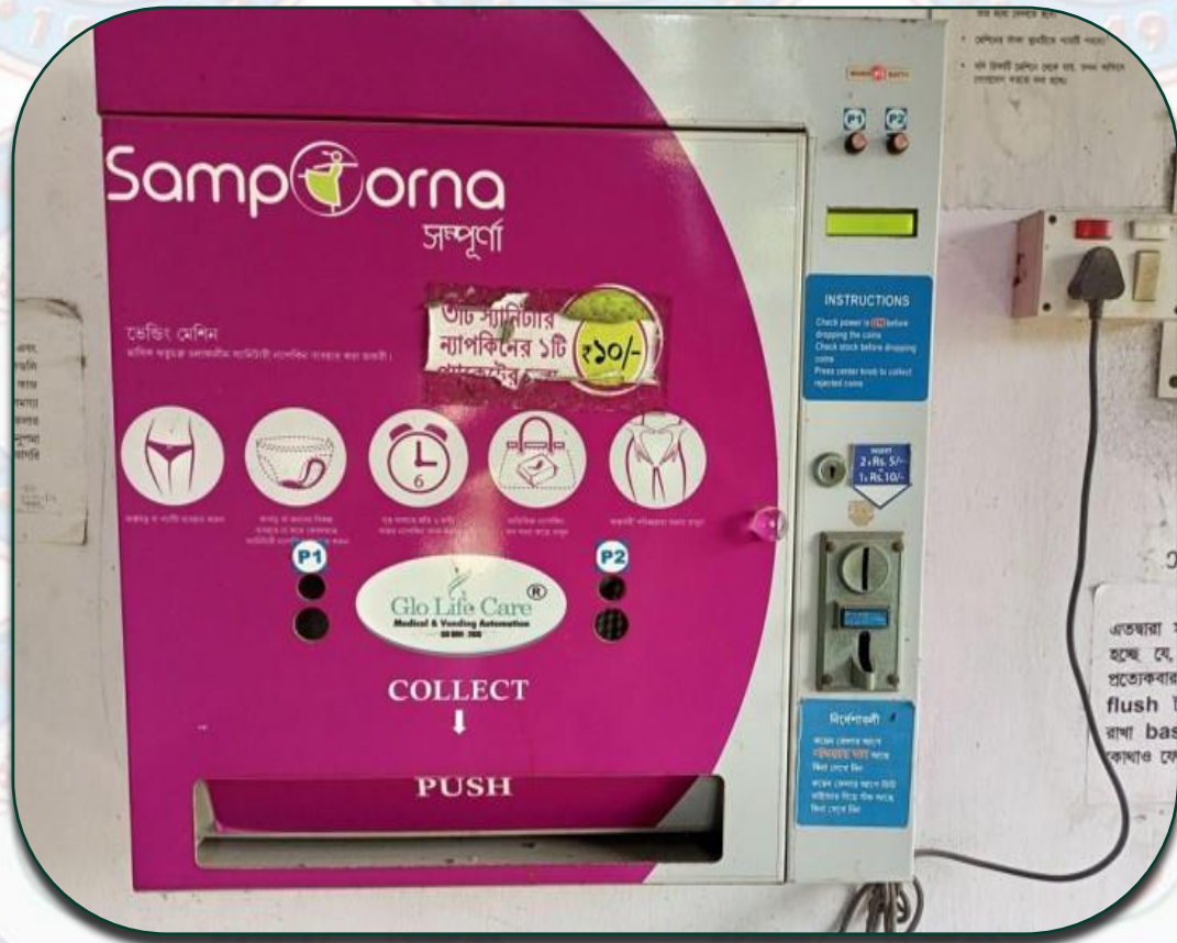
Automatic Sanitary Pad Vending Machines (2)