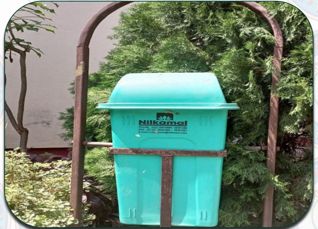
Dustbins in Campus Area