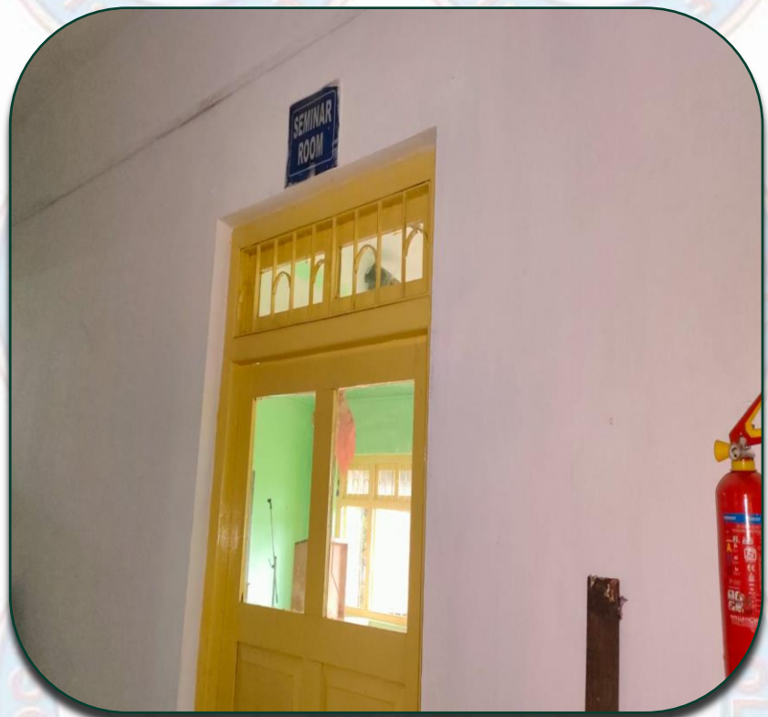
Seminar Rooms (2)