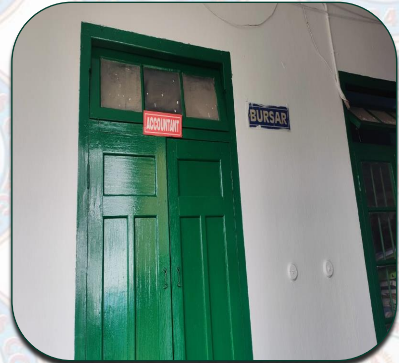
Accountant & Bursar's Office