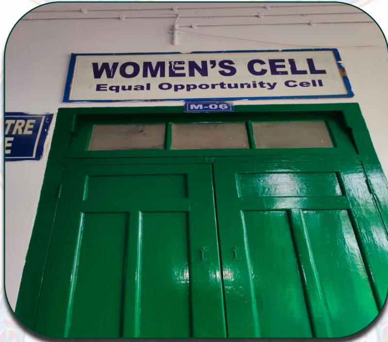
Equal Opportunity Cell

Ensures inclusive access and equal opportunities for all.